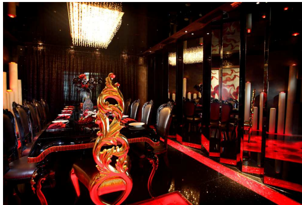
Hell is the best for an alternative extreme chic wedding