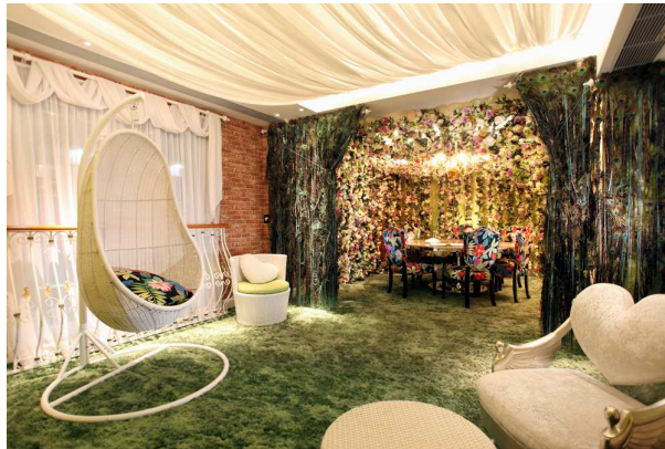
The truly enchanting happy and beautiful life of each couple will be captured in this dreamy Utopian setting Eden